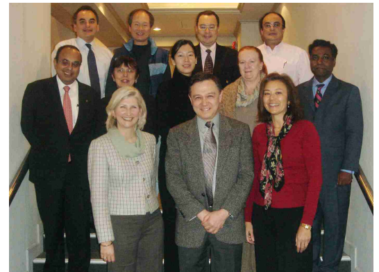
KGV Alumni Committee.

We plan to be more visibly active and have